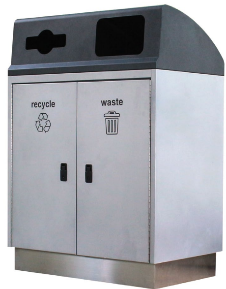
AVAILABLE ELEVATED BASE